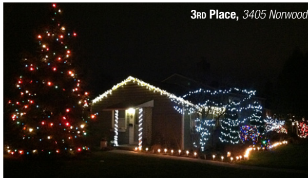
3rd Place, 3405 Norwood